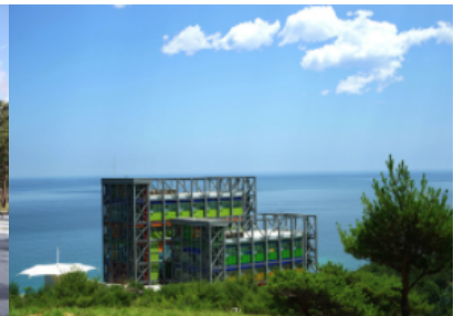
Haslla Art World & Pinocchio Museum

#Gangneung art museum #Pinocchio #Haslla