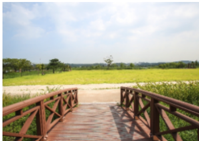
Gyeongpo Eco Marsh Park

#Sunrise #Hourglass #Jeongdongjin Station